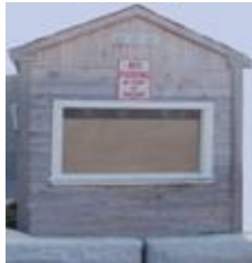
(1) Cameras Installed

Bedford MA – The Secure-A-Lot Sticker-less Sticker Program has finished its first successful year of operation for the DPW in Plymouth, MA.