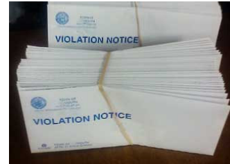
(4) Citations Mailed

The Town now sells permits to access the Solid Waste Transfer Stations and electronically monitors the license plates of authorized cars using the facilities – so, no sticker is required. The Secure-A-Lot system provides full-time enforcement – automatically!