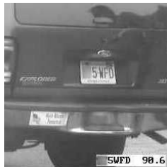
(2) Plates Read